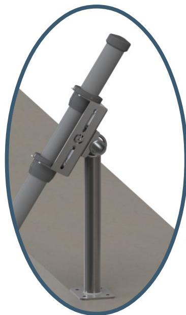
Vertical or horizontal direct mount onto a tank or channel wall

Handrail Connection to allow sensors to be angled into effluent flow